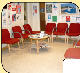
sexual health clinic